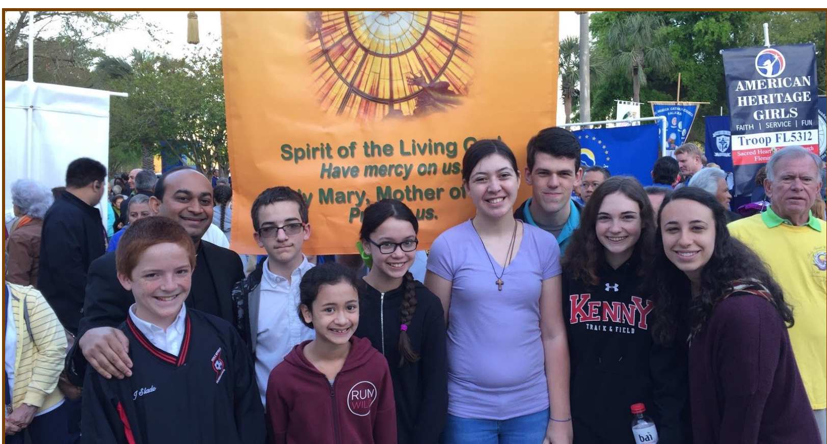
Youth Ministry helping carry the banner at Eucharistic Congress