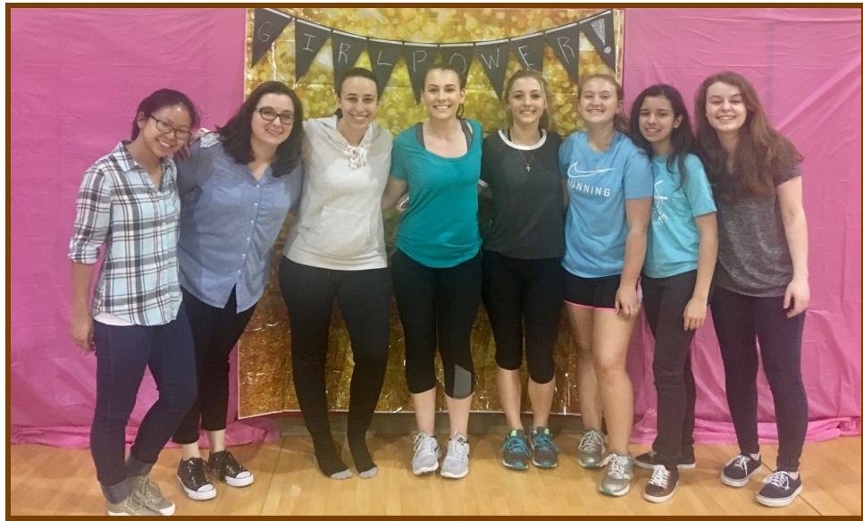
Ladies Night Life Teen

I only highlighted a few awesome events from this year, but some more include: garage sale fundraiser, ladies night, watching St. Paul The Apostle with Life Teen, Rise up, Women's Book Study, Just 5 Days Middle School Mission Trip and Summer Small Groups.