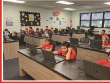
School Tour January 28th, 12:30 pm

FLORIDA'S ONLY PRIVATE Elementary school named a 2022 National Blue Ribbon School