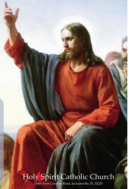
Holy Spirit Catholic Church 11665 Fort Caroline Road, Jacksonville, FL 32225

COME JOIN US FOR THIS ORIENTATION CLASS!