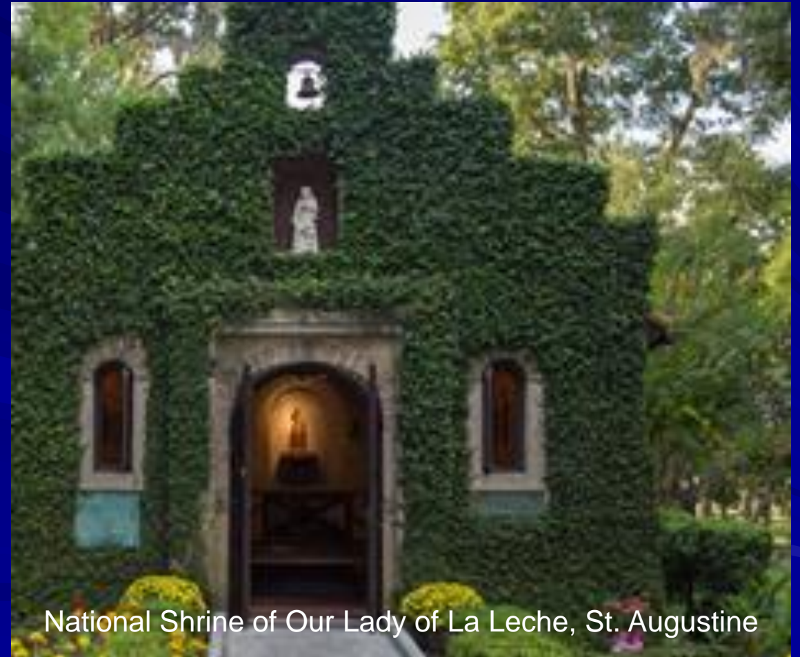
National Shrine of Our Lady of La Leche, St. Augustine

Pope Francis in the 2017 Motu Proprio “Sanctuarium in Ecclesia” describes a Shrine as a place of evangelization where pilgrims experience deeply God’s closeness, the tenderness of the Virgin Mary and the company of the Saints...”