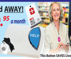
This Button SAVES Lives! As Shown GPS, Lowest Price Guaranteed!