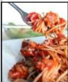
Family Life Center Fun!

The Prayer Blanket Ministry will be hosting an evening filled with traditional Italian fare, music and more.