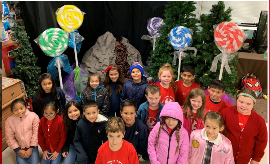
SANTA'S GIFT SHOP WAS FUN!!