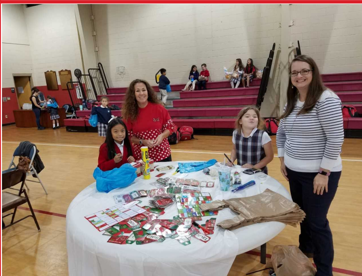
2ND GRADERS PREPARING FOR ADVENT