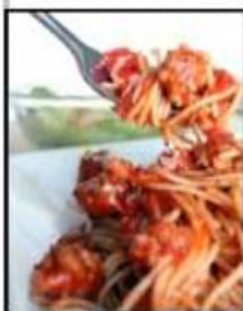
Family Life Center Fun!

The Prayer Blanket Ministry will be hosting an evening filled with traditional Italian fare, music and more.