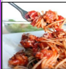
Family Life Center Fun!

The Prayer Blanket Ministry will be hosting an evening filled with traditional Italian fare, music and more.