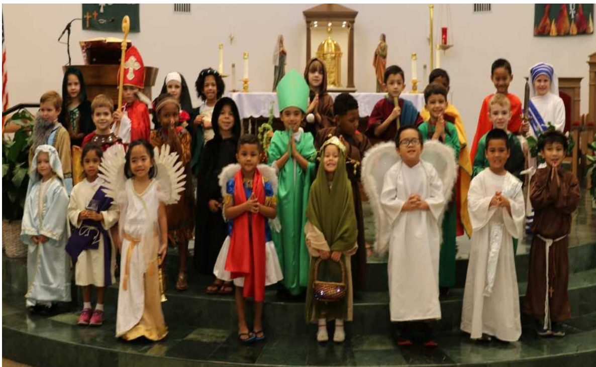
Holy Spirit Kindergarten Students in their Saints Costumes for All Saints Day at the 8:30am Mass