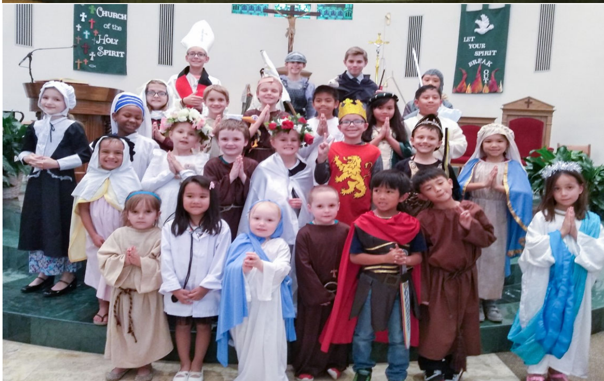
Holy Spirit CCD & Parish Children at the 7pm Mass on All Saints Day

Stop by Bambino Scoops Genuine Gelato in the Monument Rd shopping center (near Publix) on Saturday, November 17th between 12:00noon and 6:30pm and a portion of your purchase will be given back to Holy Spirit School! A yummy way to support God's children.