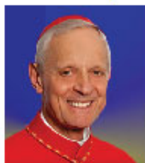
Cardinal Donald Wuerl